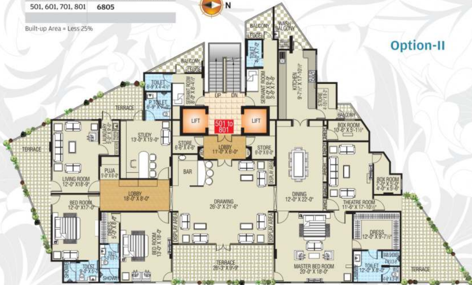
Fifth to Eight Floor Plan