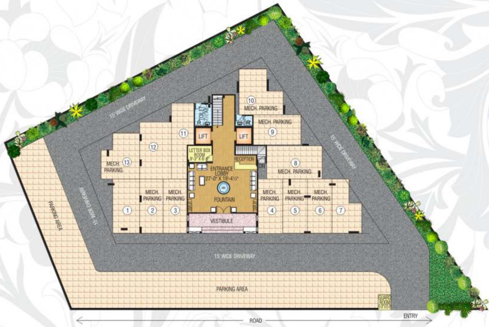
Stilt Floor Plan