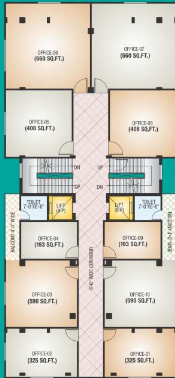
Super Builtup Area Less 20% SECOND FLOOR PLAN