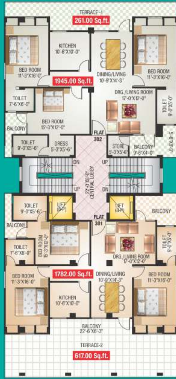
Super Builtup Area Less 20% THIRD FLOOR PLAN