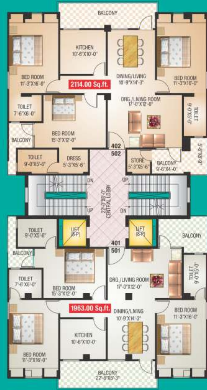
Super Builtup Area Less 20% FOURTH & FIFTH FLOOR PLAN