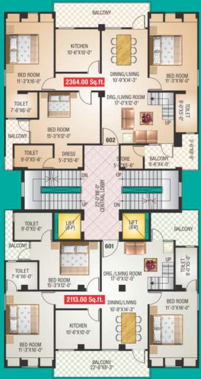
Super Builtup Area Less 20% SIXTH FLOOR PLAN